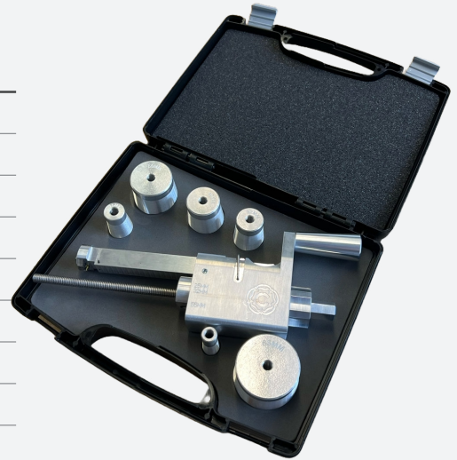
Calderprep™ Plus Tool Kit